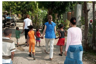
Gathering the children for Sunday School