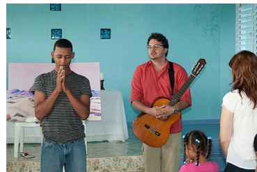
Teens join in leading Sunday School