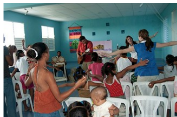
They love to sing!